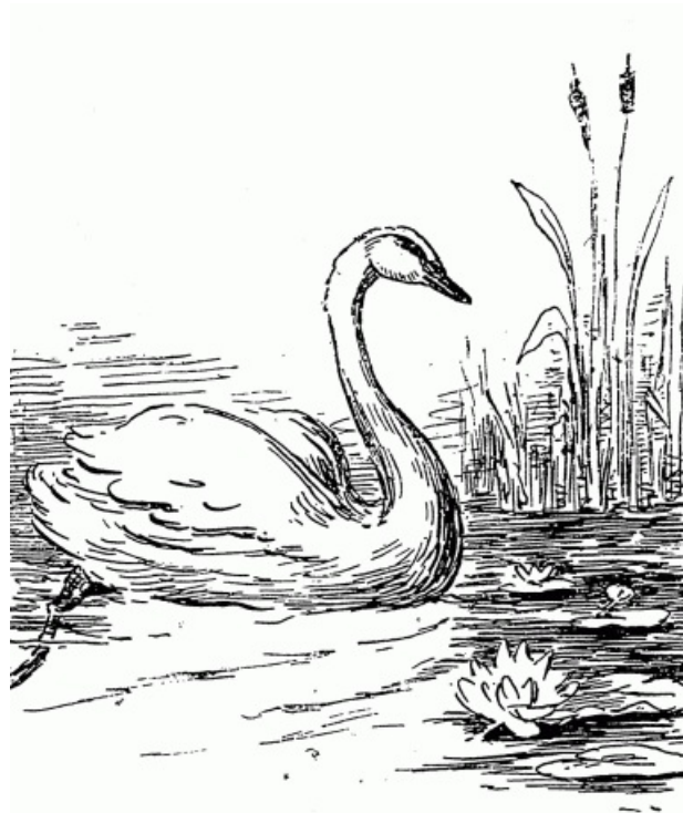
THE Queen of the Lake.

"Tell me what you dreamt last night," said his sister Nellie, as, tired from her walk home from school, she threw herself down on the grass beside him. "You look so bright, I know you must be thinking of something nicer than usual."