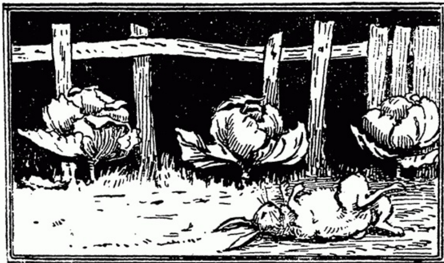
THE DYING RABBIT.

Katie ran with speed, for the sudden hope came to her that it might be her dear little rabbit. And it was the runaway. But alas! he held the poor dying little creature in his hands just breathing its last. Tommy had caught sight of the rabbit among the cabbages, and thinking he was doing a good deed in killing a wild rabbit that was doing damage in the garden, had struck it across the neck with a stick he had in his hand and given it its death-blow.