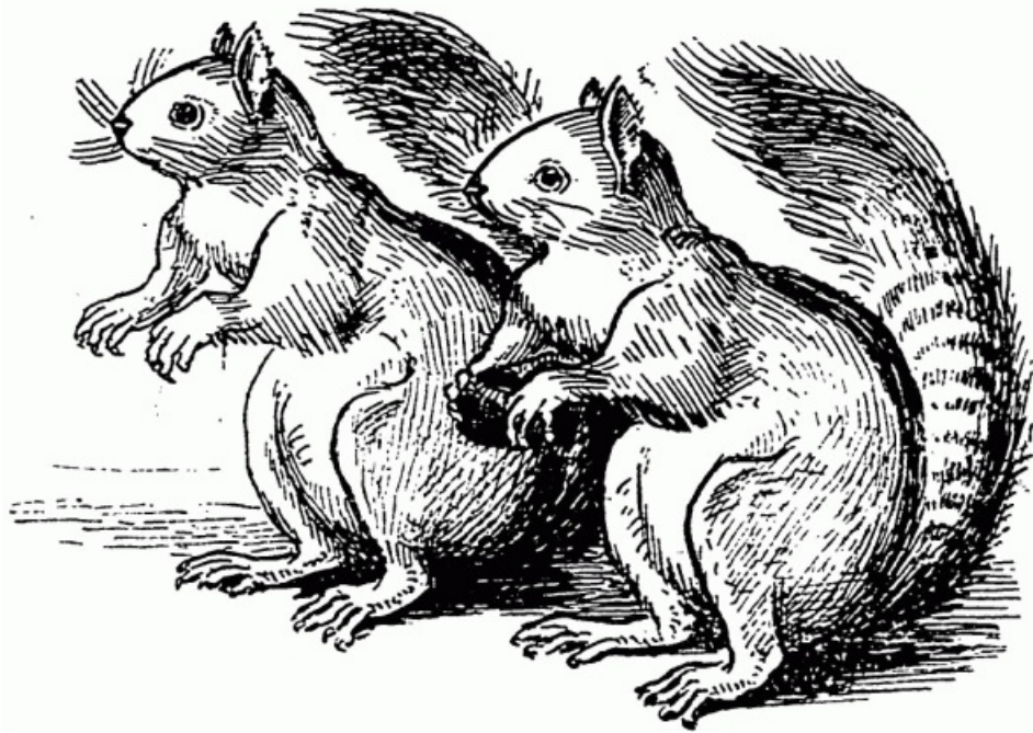
TAT AND TIT.

The squirrels have no hands to carry what they gather, but they have little pouches, or pockets, in their cheeks that they fill with seeds or nuts or whatever they wish to carry, and these they can empty when they reach their storing-place. You cannot see them at work filling these pouches; but they can stuff a great deal into them, and are busy running to and fro all day filling and emptying them.