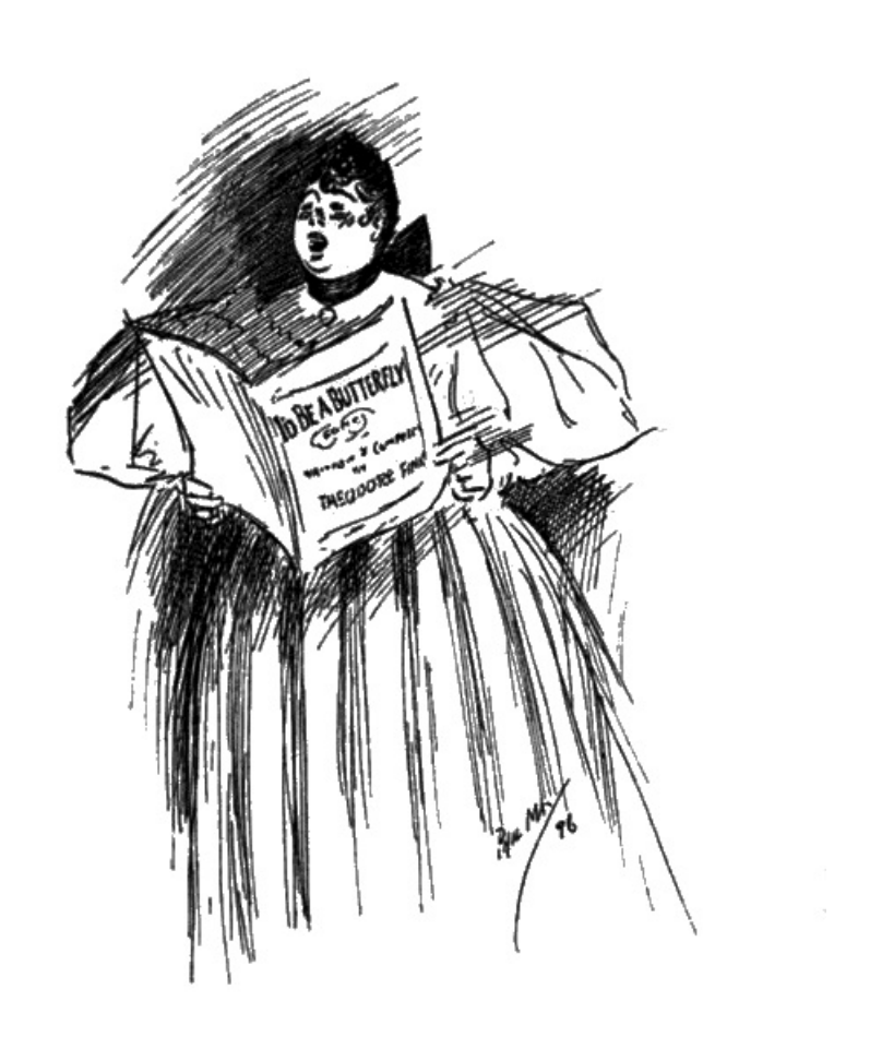
"I'd be a Butterfly."