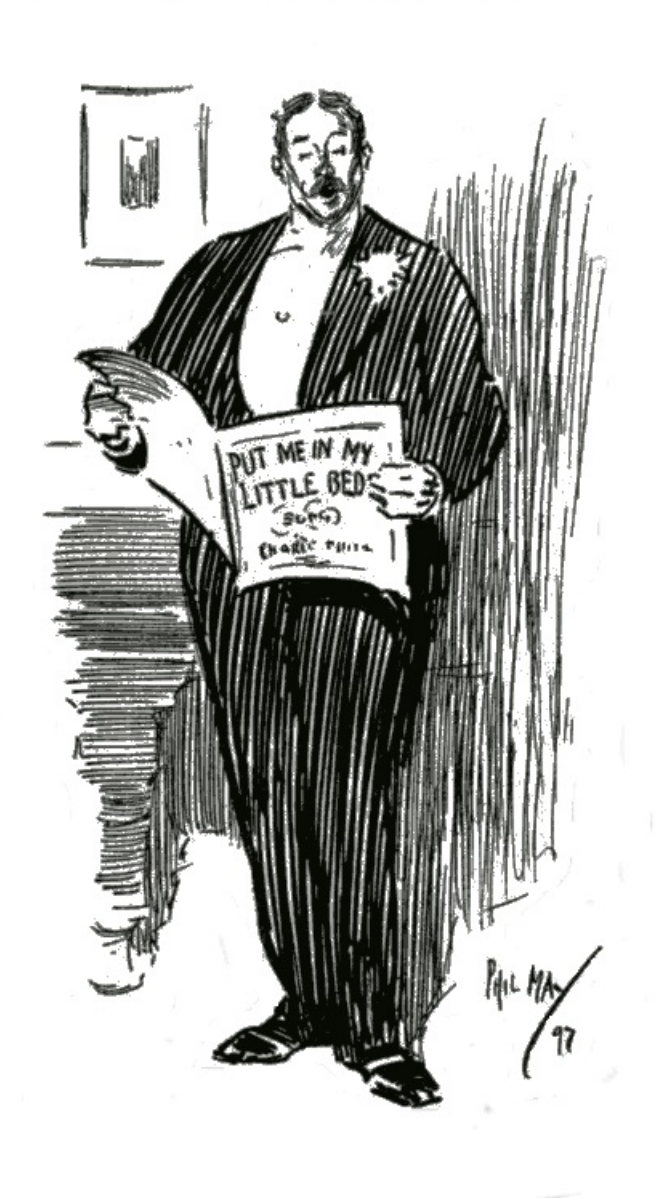
"Put me in my Little Bed."