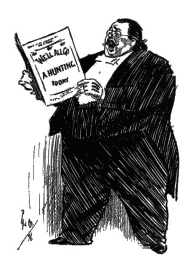
"We'll all go a Hunting To-day."