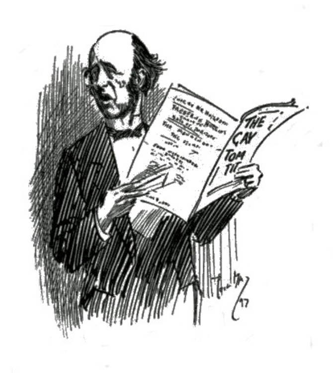
"The Gay Tom Tit."