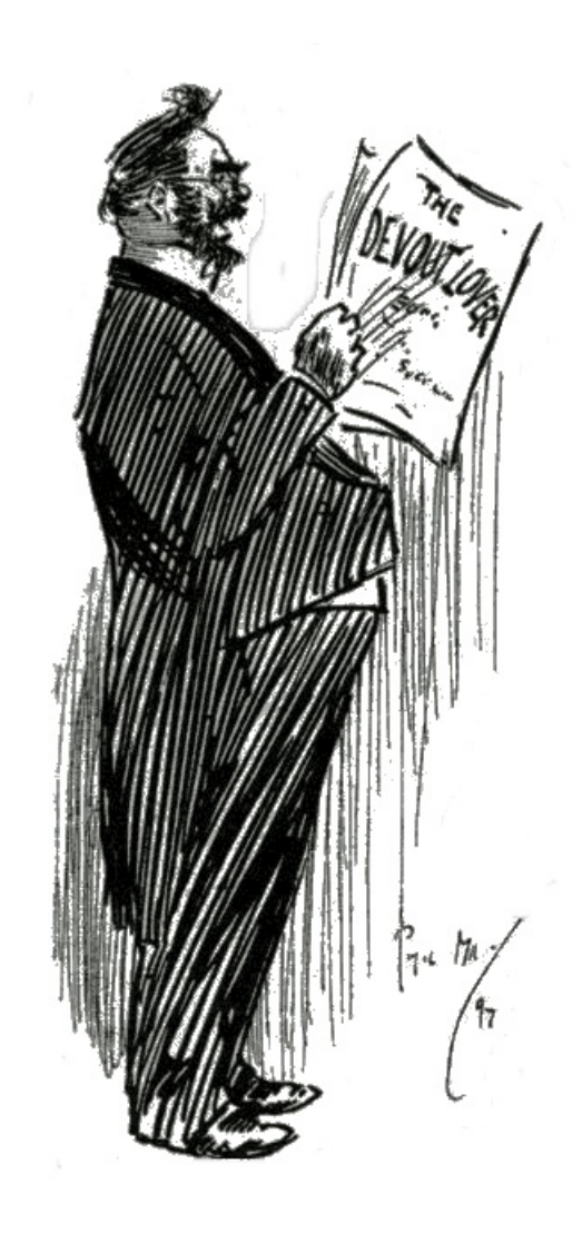
"The Devout Lover."