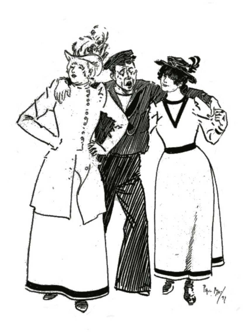
"There's only one Girl in the World for me!"

[End of Songs and their Singers by Phil May]