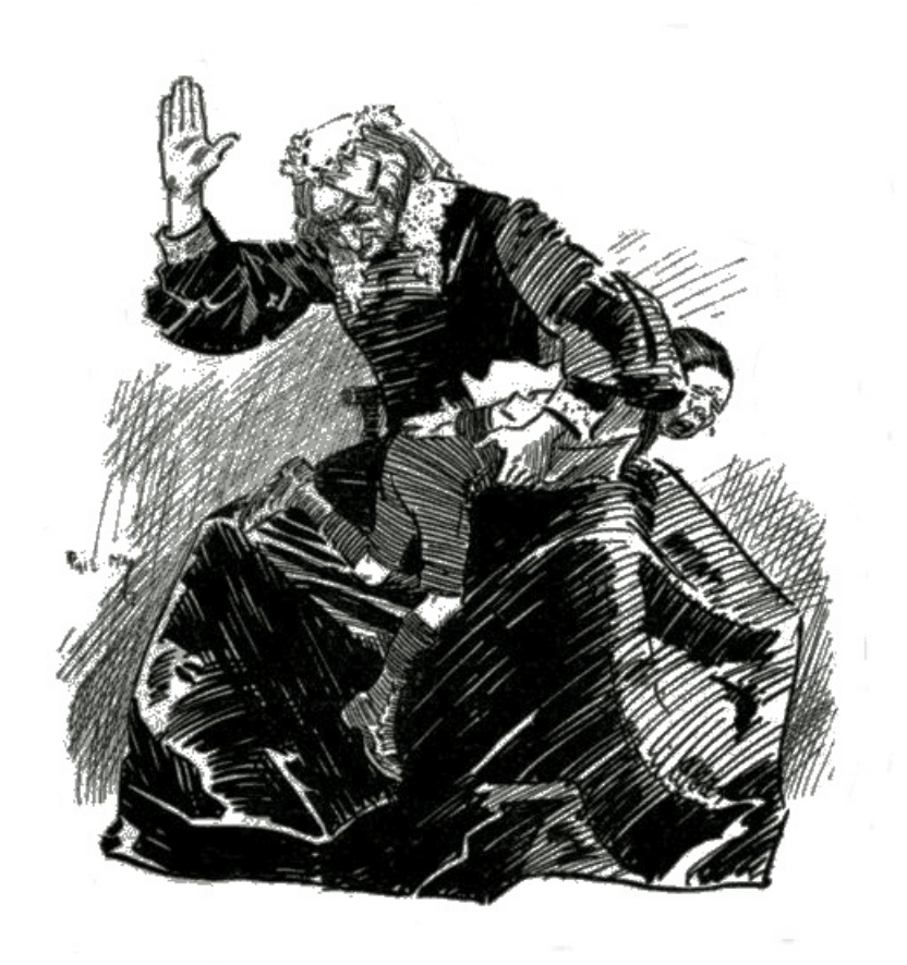
"'Tis Hard to Give the Hand, & c."