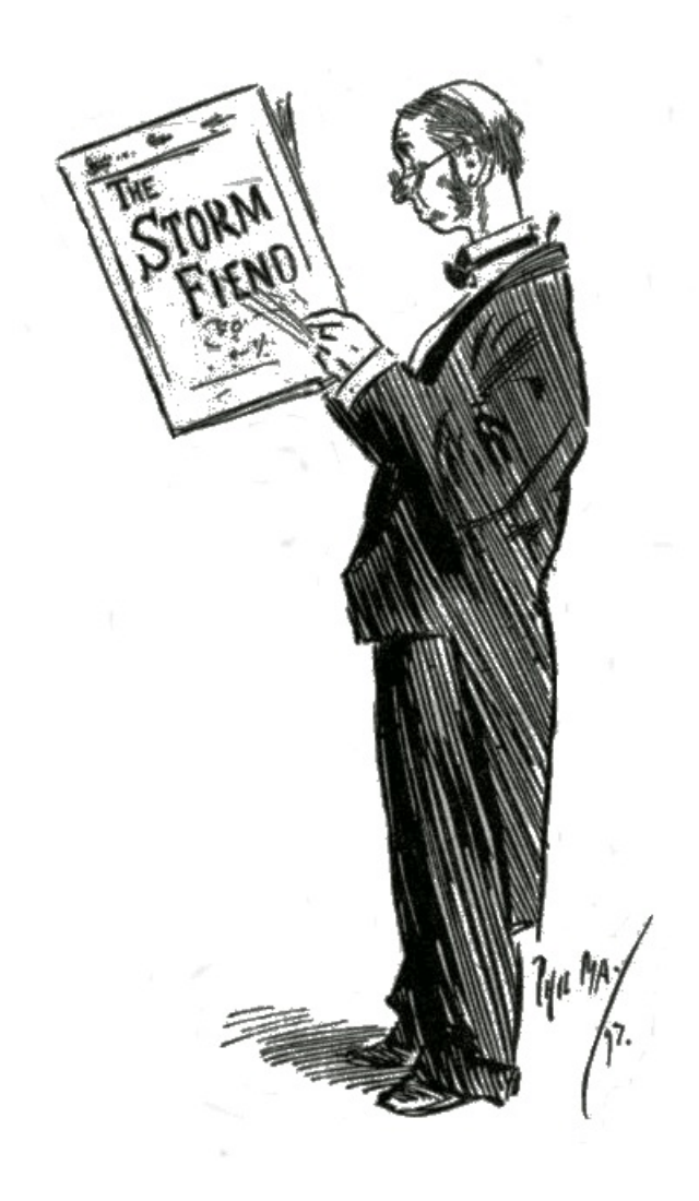
"The Storm Fiend."