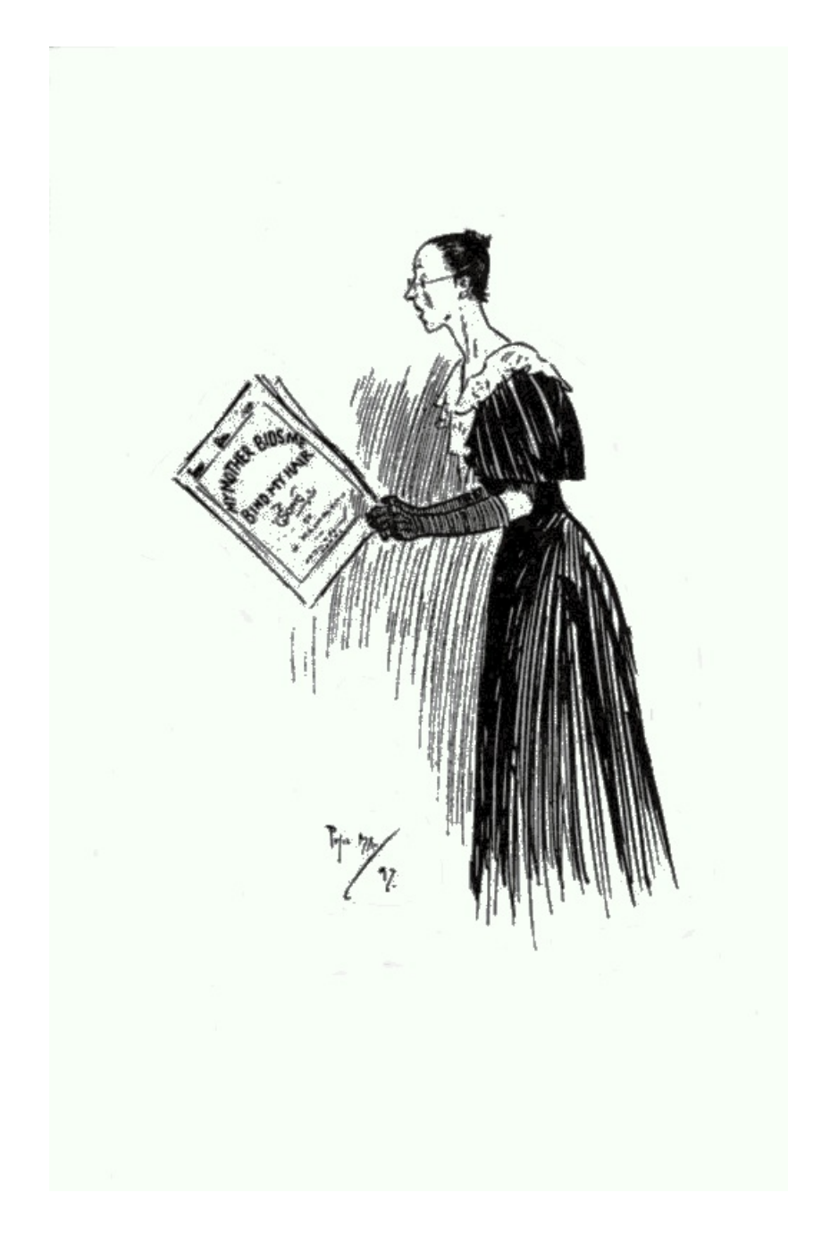
"My Mother bids me Bind my Hair."