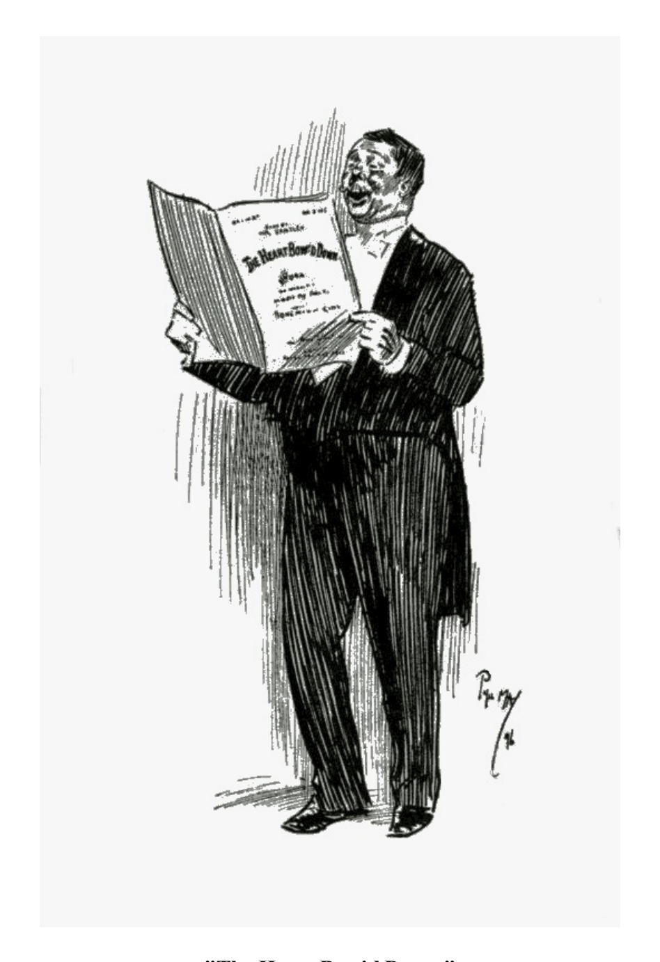
"The Heart Bow'd Down."