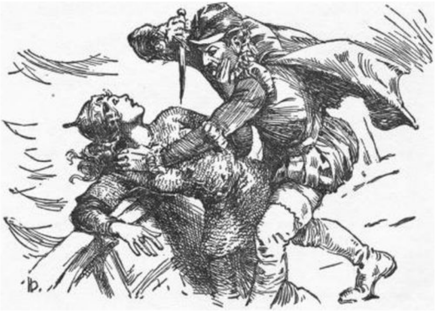
Bardi, a bloody stiletto in his hand, struck at her again, again.

To Devries, this moment was frightful. He seemed palsied, unable to move, as the corsairs came across the stern-deck with a rush, as the yelling slaves gathered to meet them, as the Countess Alix flew like a tigress at Bardi and cast off the ropes the Florentine had lowered. Then she slumped away, catching at the rail, and Bardi, a bloody stiletto in his hand, struck at her again, again—