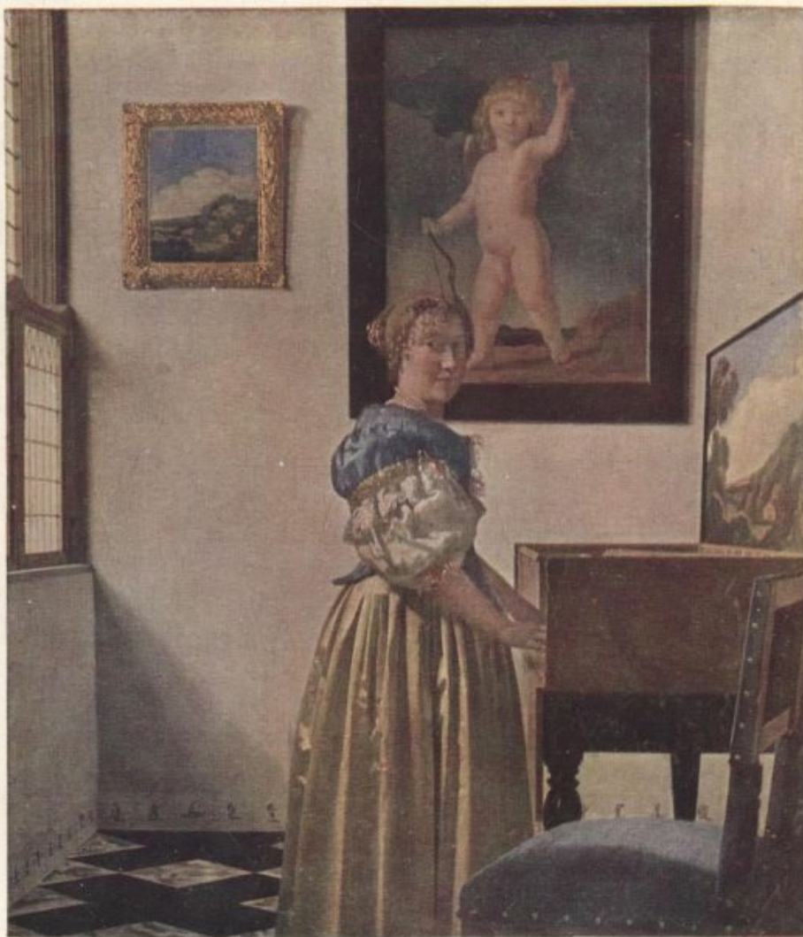
A LADY AT THE VIRGINALS