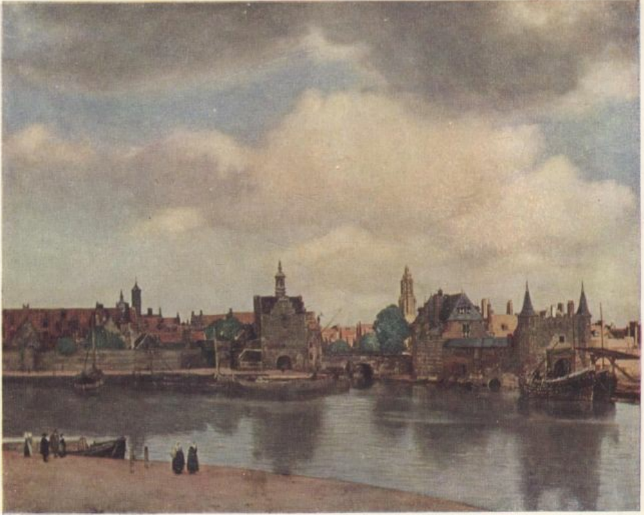
VIEW OF DELFT