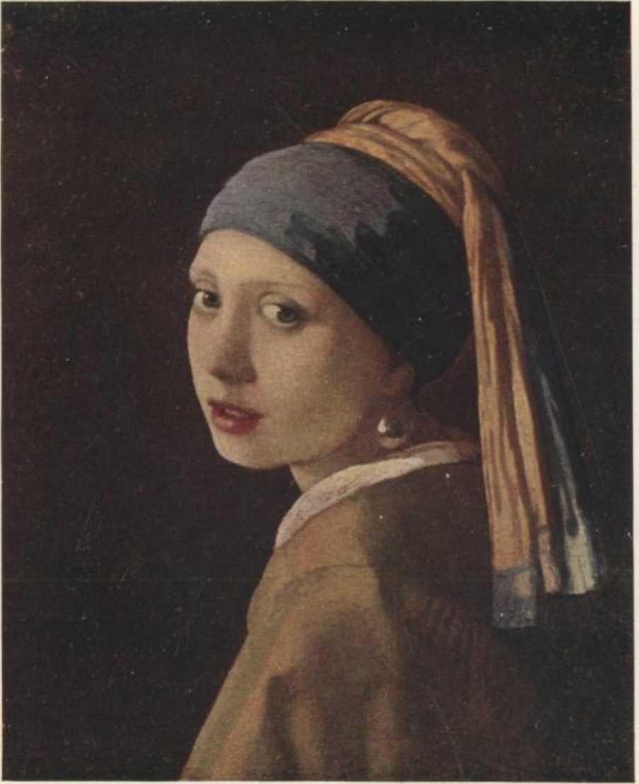
HEAD OF A YOUNG GIRL