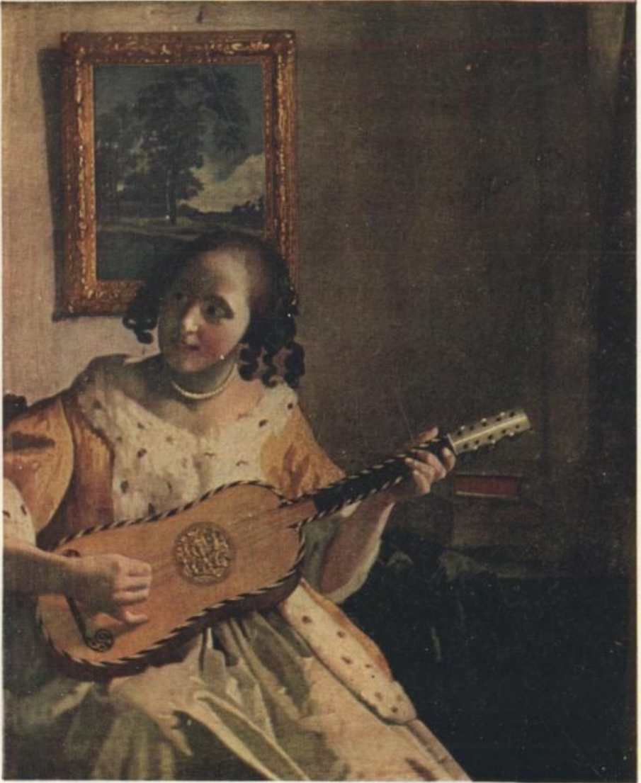
THE GUITAR PLAYER