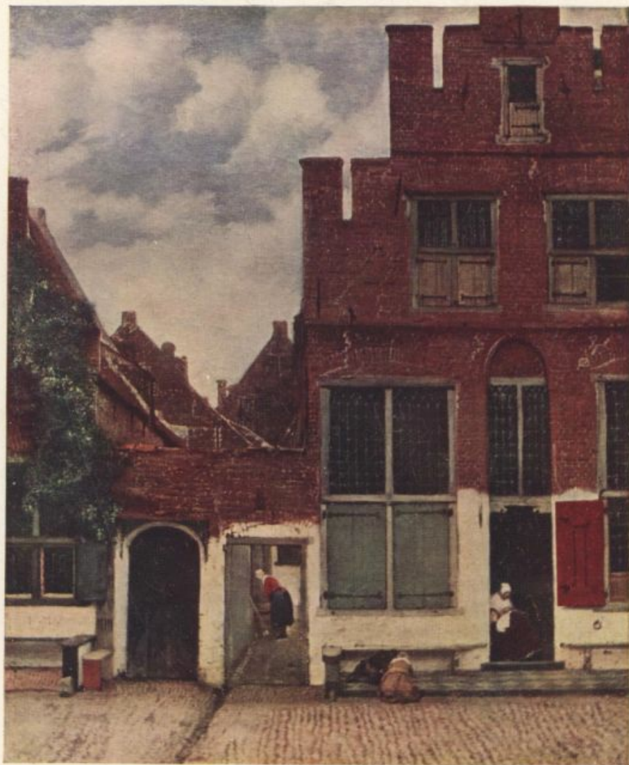
THE LITTLE STREET