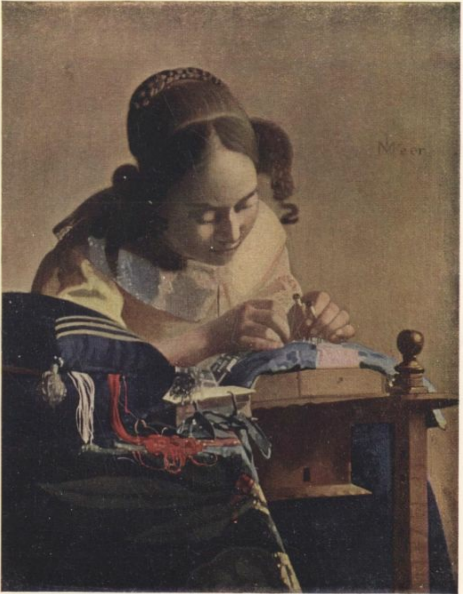
THE LACE MAKER