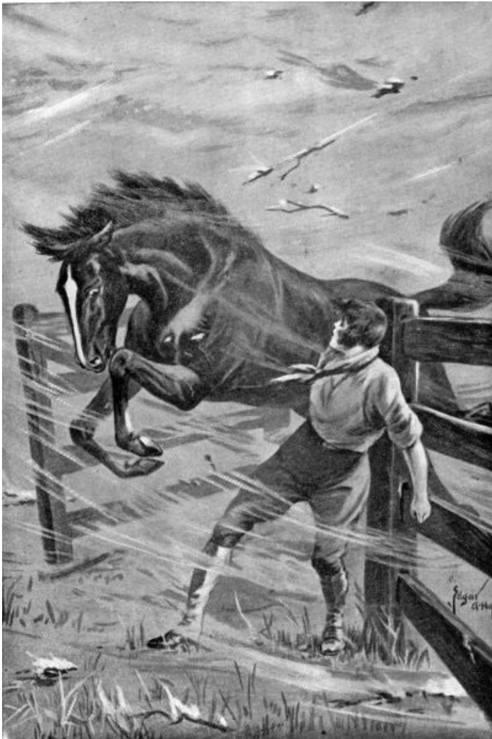
Robin flung the gate open.