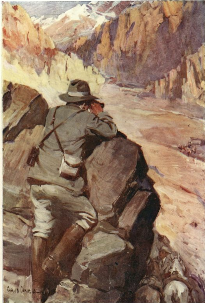
THE AMBUSH AT THE REST HOUSE

mile east of the road. And as he moved his glass over the intervening space, he caught sight of a small building which had hitherto escaped his notice, so like was it in colour to the rocky ground surrounding it. In general shape it reminded him of the little wayside shelters which, called dak bungalows in India, were known beyond the borders as rest-houses. But this building was apparently fallen into disuse. It was roofless, and much of the stonework of the walls was broken away.