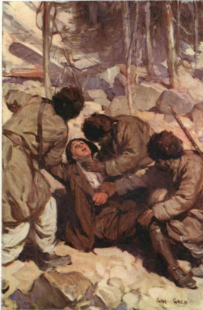
THE KALMUCKS MAKE A PRISONER

And then he saw something flickering by a tree up the hill-side. It seemed to be a piece of cloth. Was it a flag of truce? While he was watching it there was a patter of feet behind him. Three men had risen as it were out of the earth southwards of the hollow. Before he could rise they flung themselves upon him. He was dashed to the ground. He made desperate efforts to free himself, writhing, kicking, trying to free one of his hands to use his revolver. But