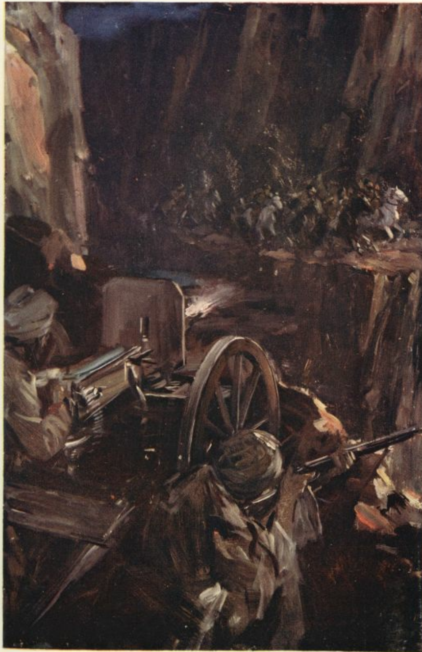
GUR BUKSH DEFENDS THE MINE

In a few minutes a large fire was blazing on a ledge of rock a few feet south of the bend, and a number of Pathans were drilling holes in the cliff. An hour's work by experienced miners would suffice, Bob thought, to prepare for the charge of dynamite. Meanwhile, in the compound, under Lawrence's direction, other men were splicing together several lengths of the wire used for conveying the current from the small electric battery to the