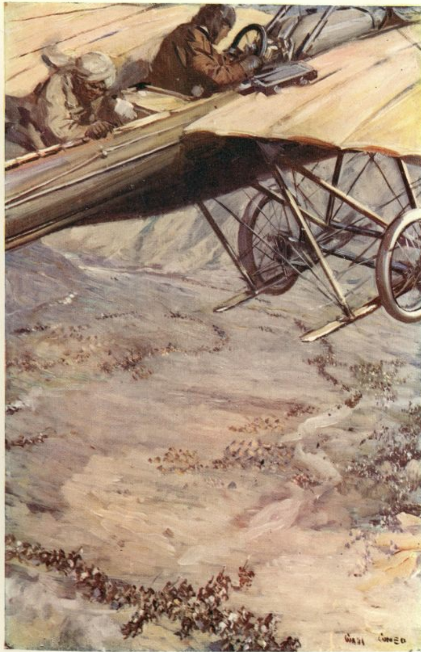
RECONNOITRING IN THE AEROPLANE

These were questions to which Bob was utterly unable to guess at the answers. His surprise and alarm did but increase as he approached the scene. Around a point where a small tributary joined the river from the south-east, extended a large bare space several miles in area. Of this open tract a portion that must have been at least a square mile in area, bounded on one side by the left bank of the tributary and on the other by the right bank of the river, was