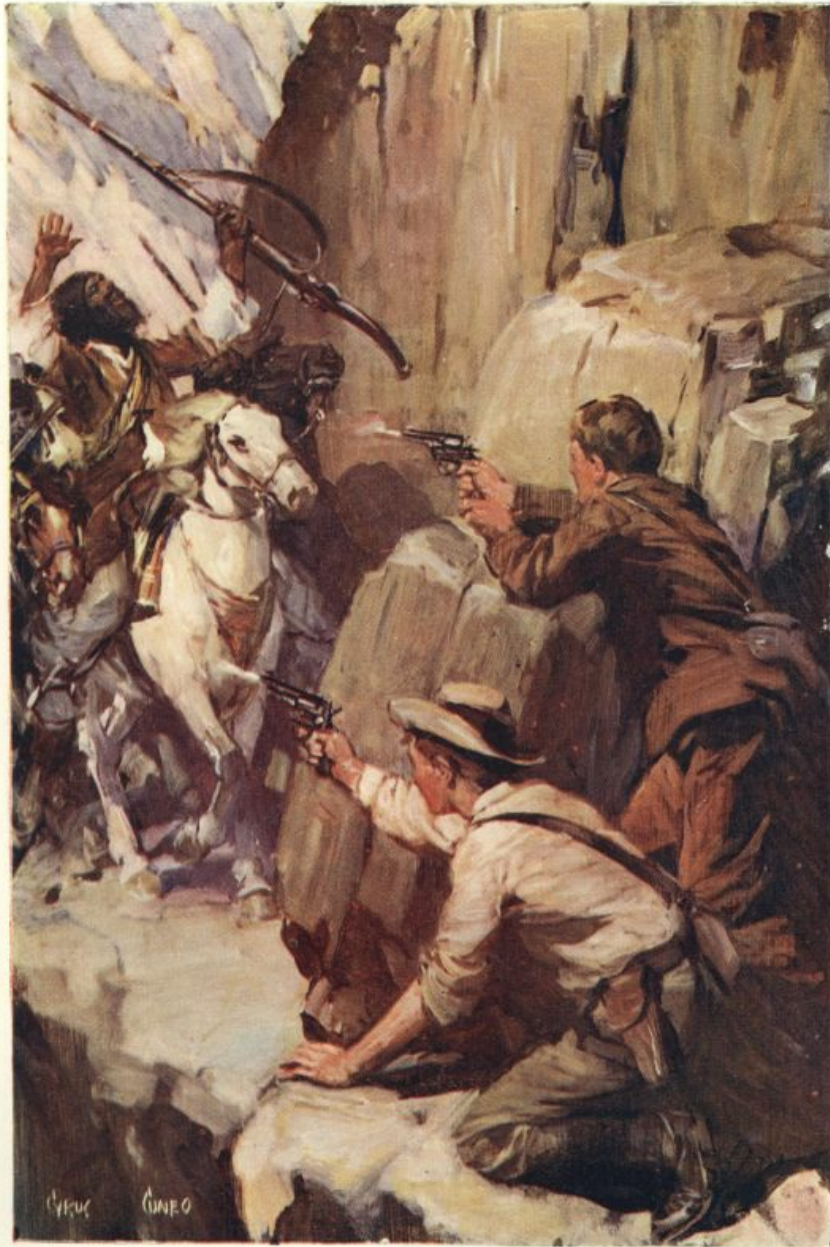
A CHECK IN THE PURSUIT

They started at once, and ran up the track, taking much comfort from the knowledge that the projecting rock would for some distance conceal them from the enemy. But after a few hundred yards the track both ascended and wound slightly to the right, bringing them once more into full view. They had no sooner reached this point than loud shouts behind them announced that the pursuit had been resumed. They glanced back, then ahead, measuring with