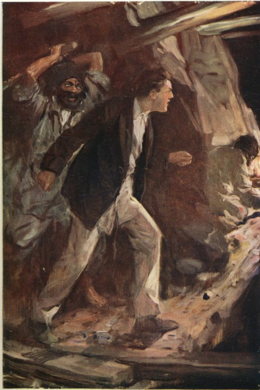
THE ATTACK IN THE GALLERY