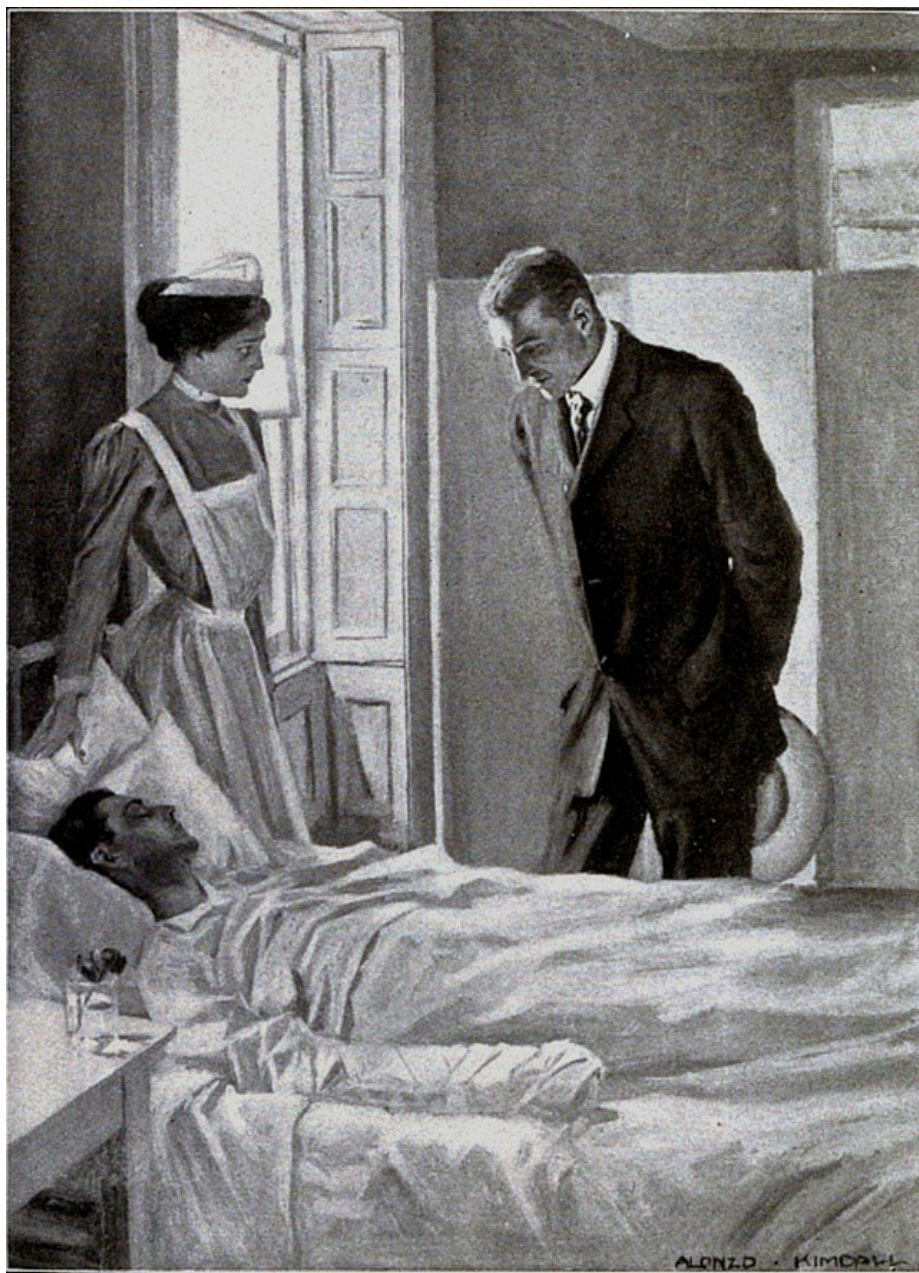
He stood by her in silence, his eyes on the injured man.