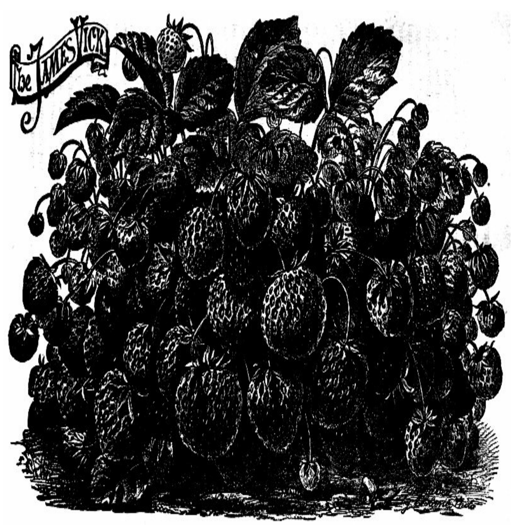
CUT OF STRAWBERRY "JAMES VICK." THIS REPRESENTS ONE PLANT WHICH BORE 280 BERRIES.