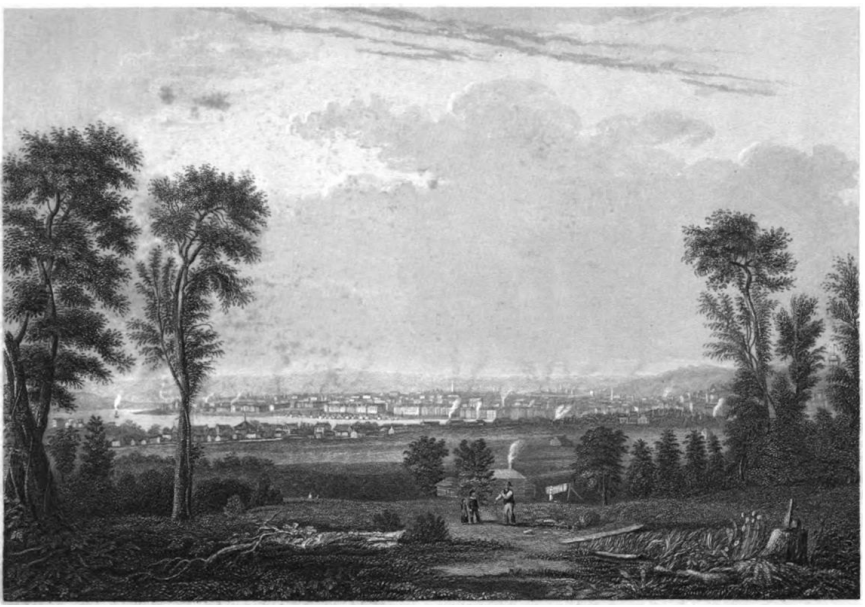
VIEW OF CINCINNATI OHIO.