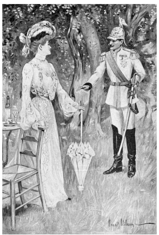
"'I BELIEVE,' HE SAID, 'THAT YOU OUGHT TO KISS—MY HAND."

"The carriage is here, your Majesty!" he announced.