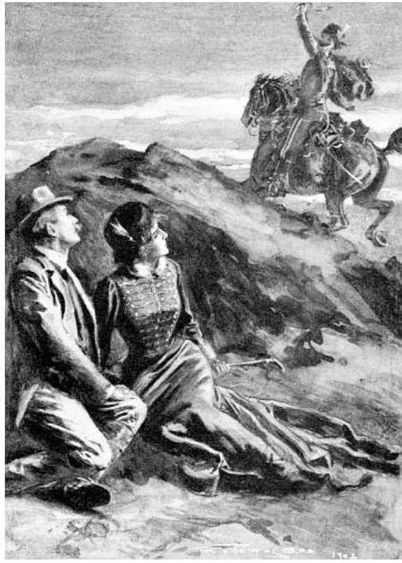
"'THE WAR IS OVER,' HE CRIED."

They rode into Theos as the King arrived from Solika. The Cathedral bells clanged out a welcome, the people lined the streets, everywhere breathless excitement prevailed. Old Baron Doxis met the King on the palace steps. He held out both hands, but his eyes were wet with tears.