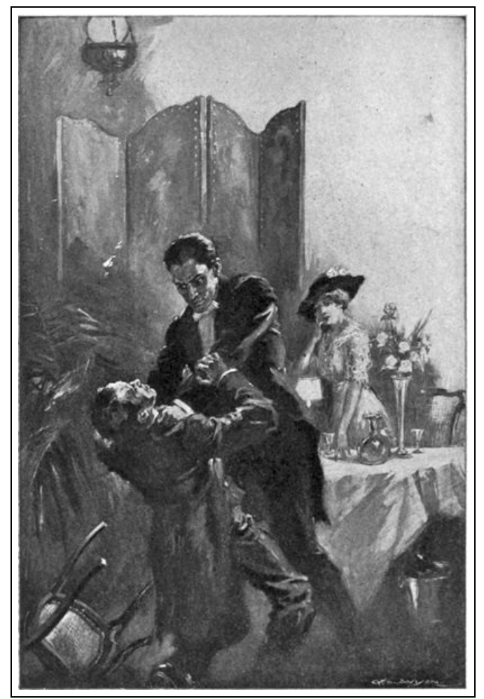
What followed came like a thunder-clap. Frontispiece. See page 304.