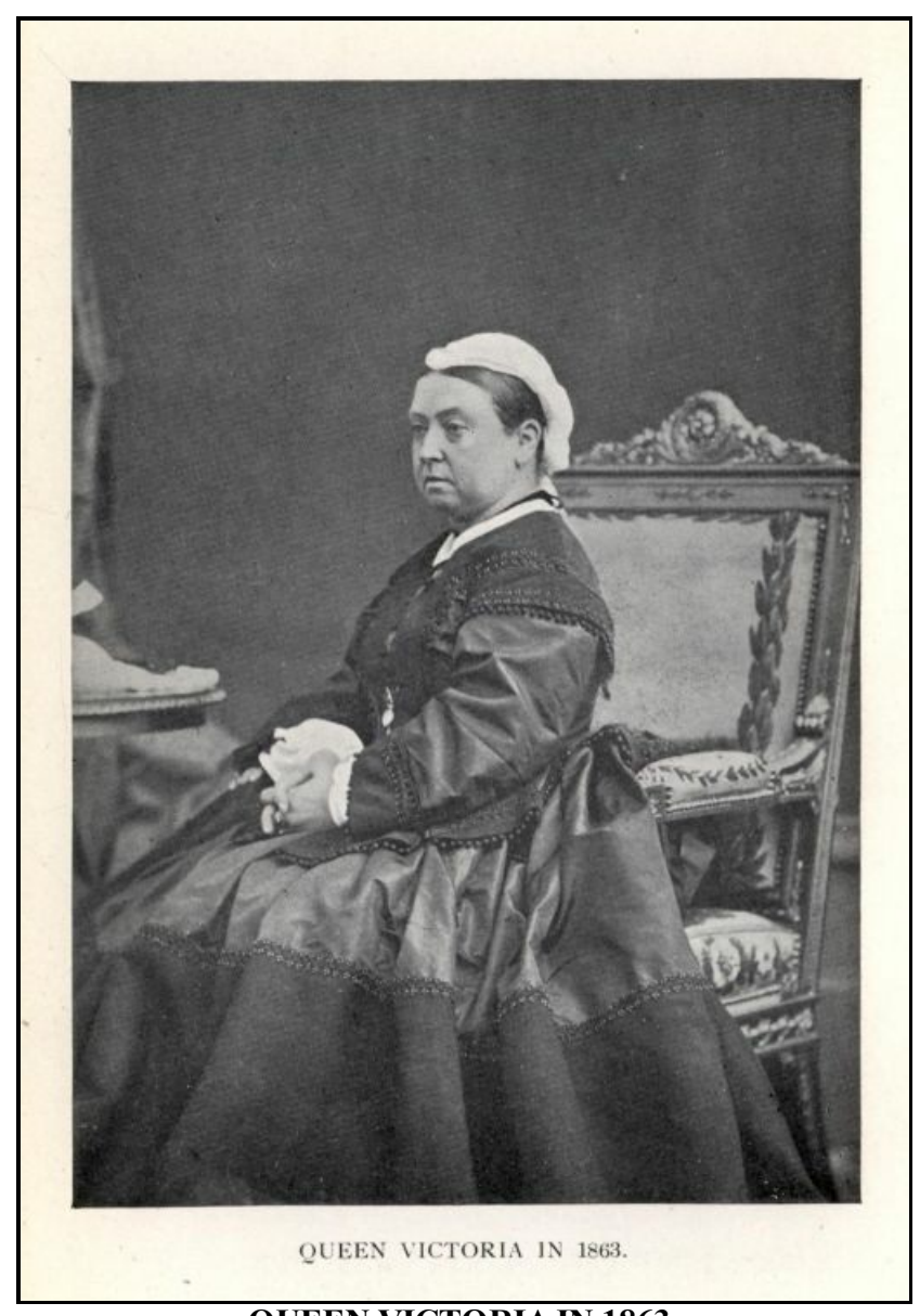
QUEEN VICTORIA IN 1863.