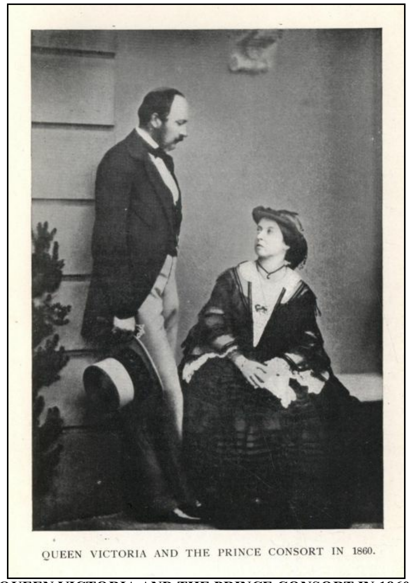
QUEEN VICTORIA AND THE PRINCE CONSORT IN 1860.