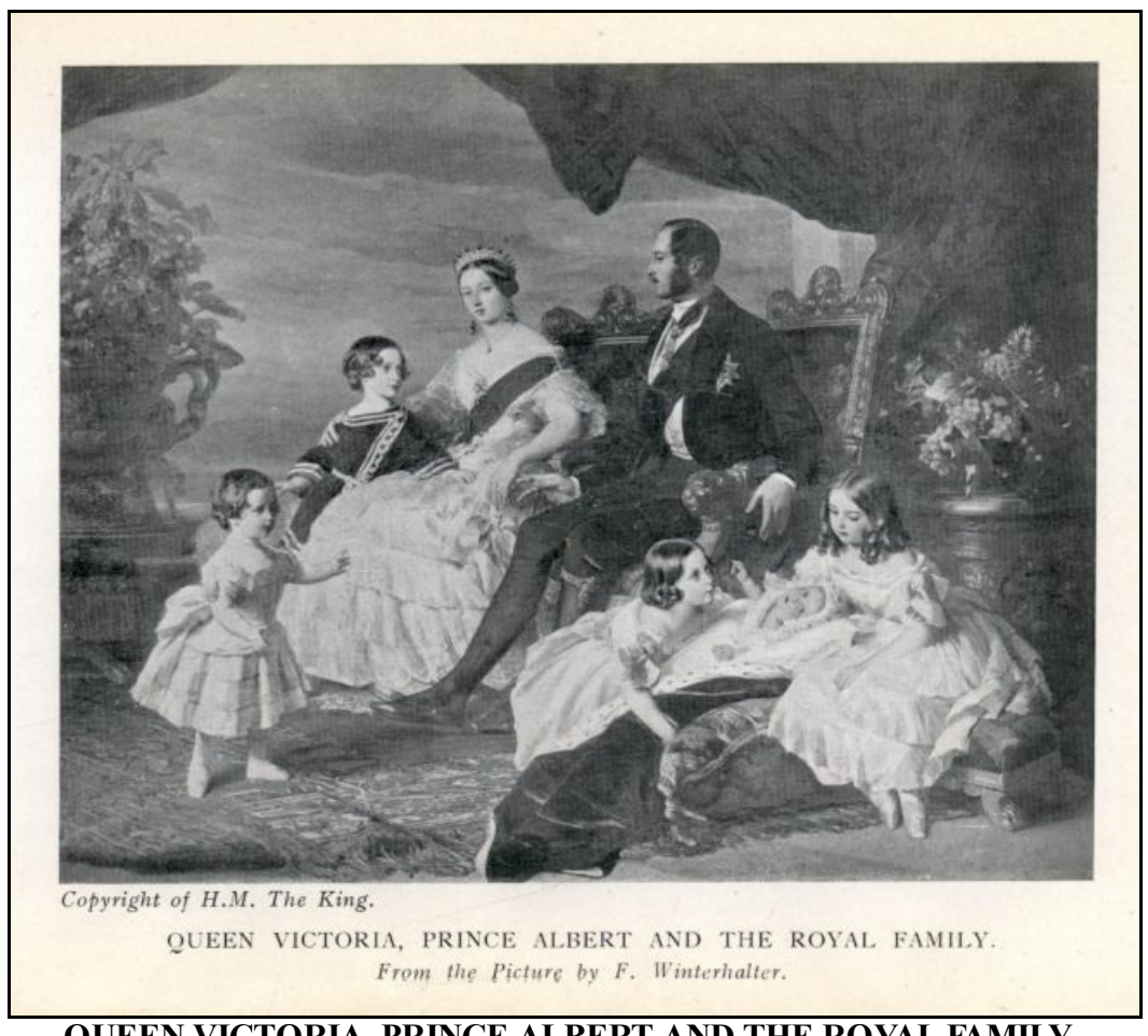
QUEEN VICTORIA, PRINCE ALBERT AND THE ROYAL FAMILY. From the Picture by F. Winterhalter.