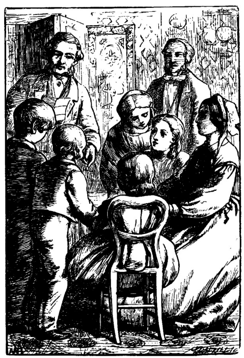
Papa revives the law of Restitution.