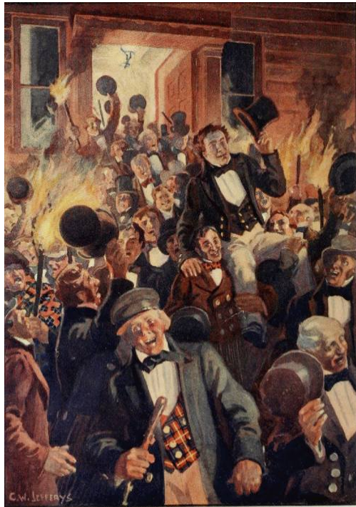
THE TRIBUNE OF NOVA SCOTIA AFTER A SPEECH IN MASON HALL