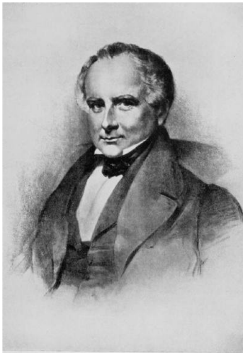
THOMAS CHANDLER HALIBURTON

From an engraving in the Dominion Archives.