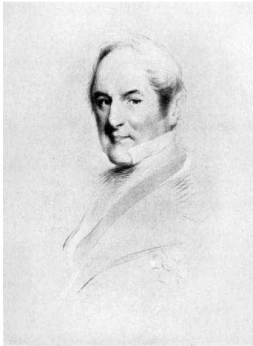
SIR JOHN HARVEY

Later in the year Lord Falkland was recalled, and appointed governor of Bombay. Soon afterwards Howe wrote to a friend: 'Poor Falkland will not soon forget Nova Scotia, where he learned more than ever he did at Court. I ought to be grateful to him, for but for the passages of arms between us, there were some tricks of fence I had not known. Besides, I now estimate at their true value some sneaking dogs that I should have been caressing for years to come, and lots of noble-hearted friends that only the storms of life could have taught me adequately to prize.'