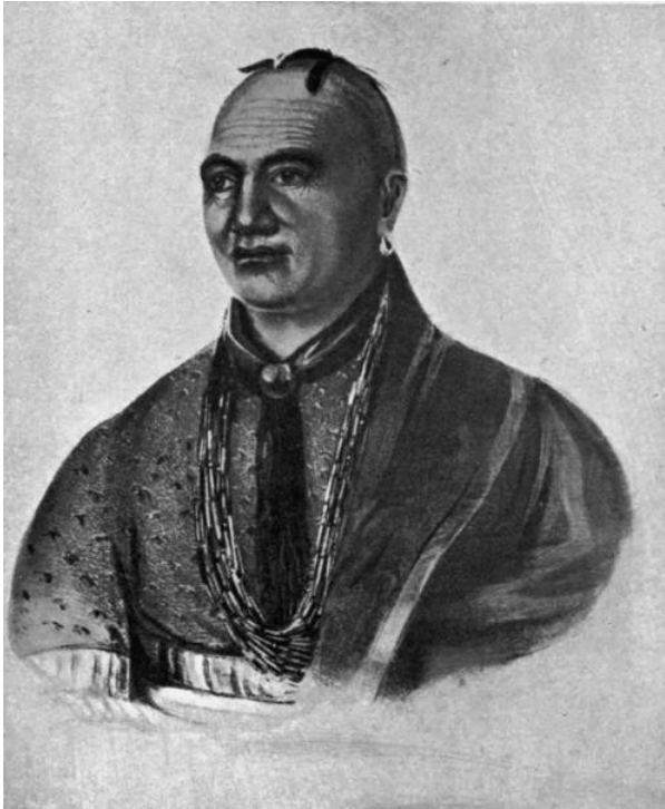
JOSEPH BRANT From a portrait in the Indian Department, Washington.