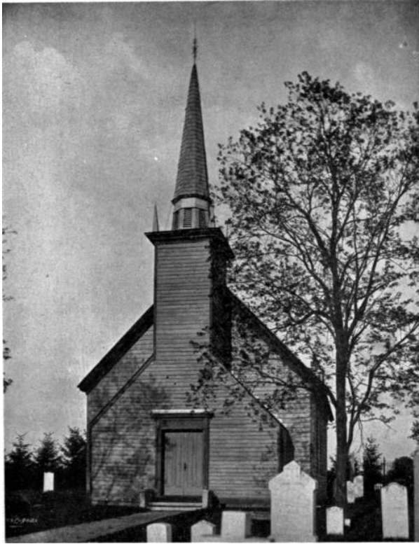
THE OLD MOHAWK CHURCH, GRAND RIVER