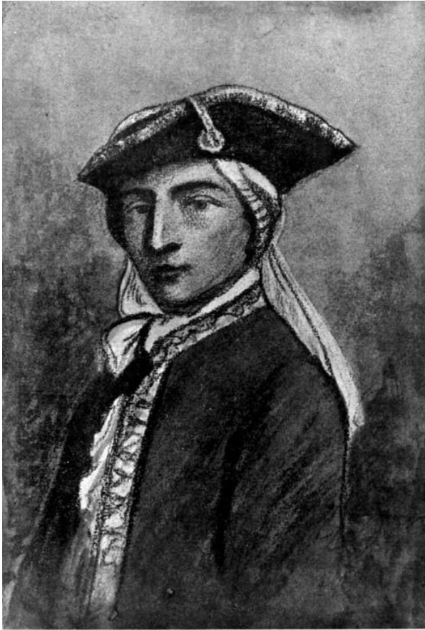
COLONEL GUY JOHNSON

From the John Ross Robertson Collection in the Toronto Public Library