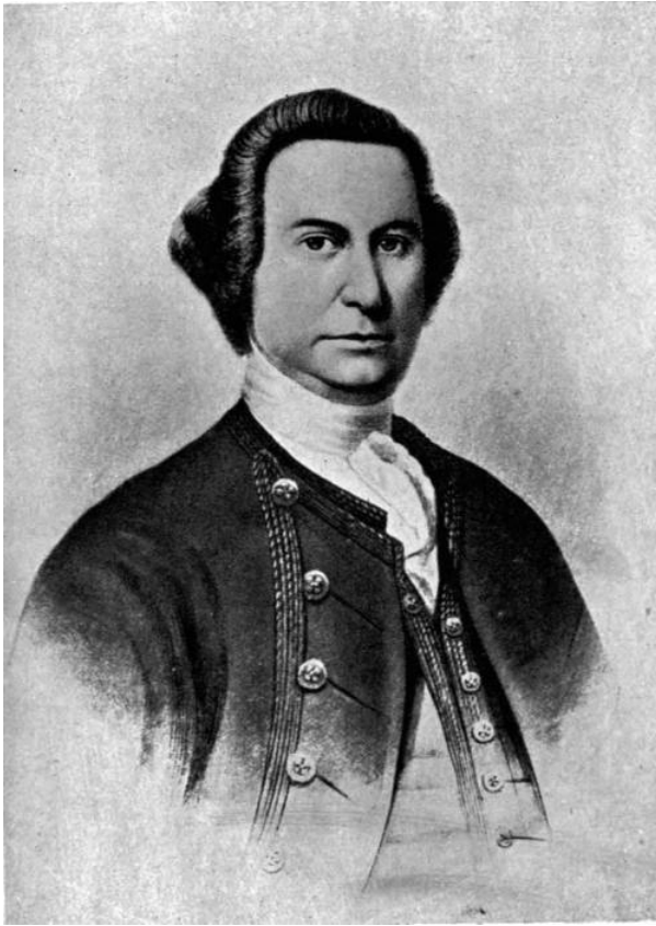
SIR WILLIAM JOHNSON From a contemporary engraving.