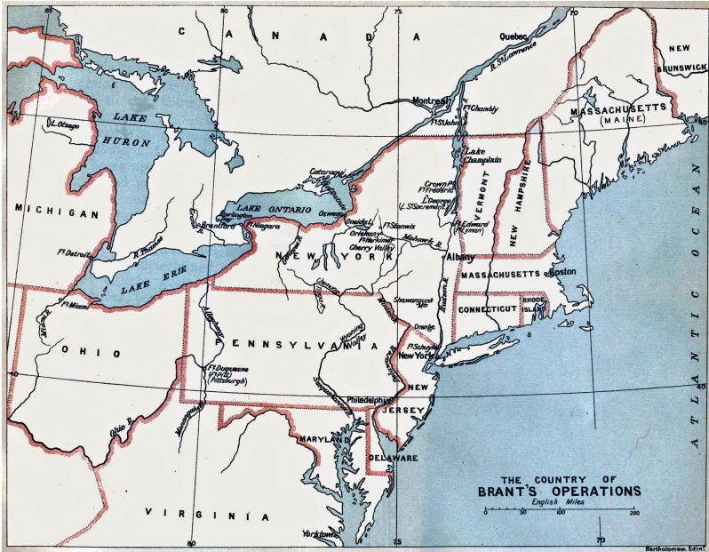
The Country of Brant's Operations.

It flashed at once across Johnson's mind that his redskin friends could aid him in the undertaking; so he sent messages with all speed to the tribes, asking them to gather at his house. Eleven hundred hungry Indians answered the summons. From all quarters they came in, taking up their residence for the time being upon his broad domain. Johnson's bright and genial face clouded as he looked upon the multitude of guests and saw his food supplies vanishing and every green thing that grew upon his fields and meadows being plucked up. But he bore it all good-naturedly, for he was determined to win their support. Seated on the grass in squads, according to their tribes, they listened while he addressed them and told them of their duties to the English crown. With rising eloquence he said that they were bound in their allegiance to the English as though with a silver chain. 'The ends of this silver chain,' he added, 'are fixed in the immovable mountains, in so firm a manner that the hands of no mortal enemy might be able to move it.' Then as he bade them take the field, he held a war belt in his hands and exclaimed with fervour: