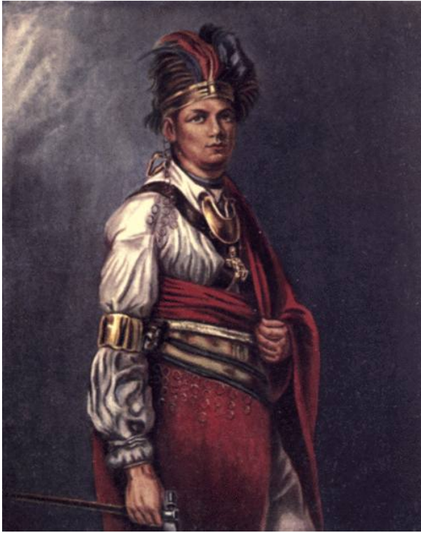
JOSEPH BRANT From the painting by George Romney