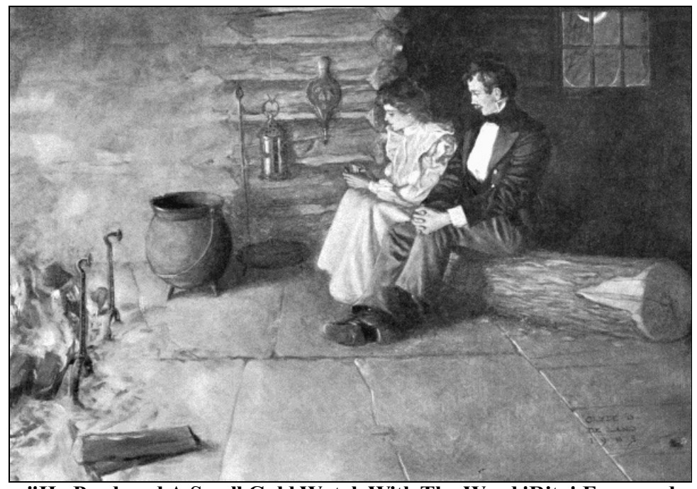
"He Produced A Small Gold Watch With The Word 'Rita' Engraved Upon The Case."