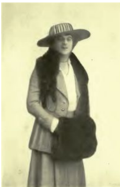
The Author as a German Governess

I learned how to walk in a ladylike fashion, and how to powder my nose in an engaging manner. My arms and legs had to be kept under various restraints. A mincing gait was soon acquired, but I found sitting still more awkward. My knees evinced an almost ineradicable tendency to cross themselves or sprawl, while my gloved forearms, to the last, felt as unwieldy as a baboon's. But everything I could I learned assiduously and in dead earnest, down to managing my veil, and patting my curls nicely in front of a looking-glass. It was so frightfully important not to make a false step.