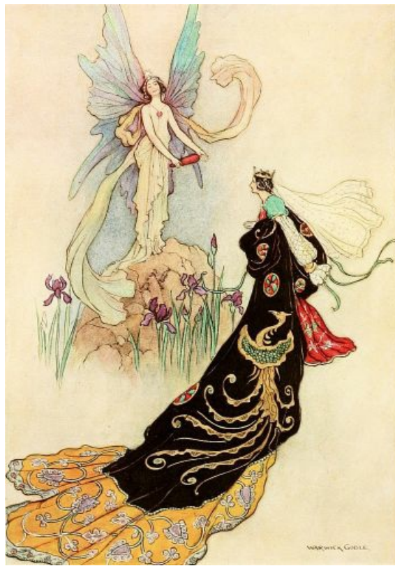
"The fairy there welcomed her majesty."

The queen was thus conducted to a delicious grove: a coral fountain rose in the midst; its waters, of the purest rose-colour, wound along the meadow, murmuring plaintive airs, whose words were perfectly distinguishable. The fairy there welcomed her majesty, who prepared to explain the occasion of her journey; but that was quite unnecessary. The fairy, exacting profound secrecy, presented her with a phial of water drawn from the fountain, strictly ordering that it should be broken when she had drank it all. The queen, charmed by this reception, made presents of inestimable value, and rejoined her maids-of-honour, who had been thrown into an enchanted sleep. They then returned to the palace in such high spirits, that all the court danced and sung for a month afterwards.