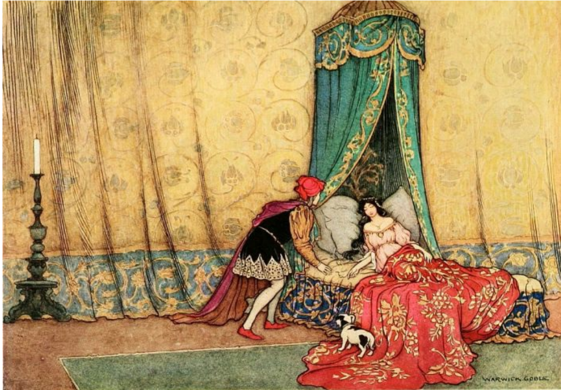
"A young girl of wonderful beauty lay asleep on an embroidered bed"

Meantime all the attendants, whose enchantment was also broken, not being in love, were ready to die of hunger after their fast of a hundred years. A lady of honour ventured to intimate that dinner was served; whereupon the prince handed his beloved princess at once to the great hall. She did not wait to dress for dinner, being already perfectly and magnificently attired, though in a fashion somewhat out of date. However, her lover had the politeness not to notice this, nor to remind her that she was dressed exactly like her royal grandmother, whose portrait still hung on the palace walls.