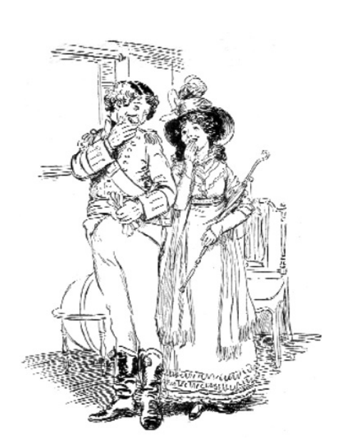
She perceives a meaning smile pass between Charlotte and the Ensign

(For the moment phoebe is flattered. Here, she believes, is some one who does not think her too old for the dance. Then she perceives a meaning smile pass between CHARLOTTE and the ENSIGN.)