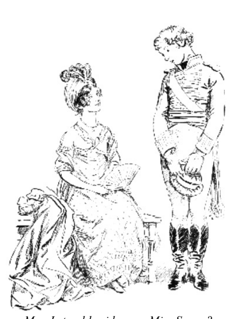
May I stand beside you, Miss Susan?