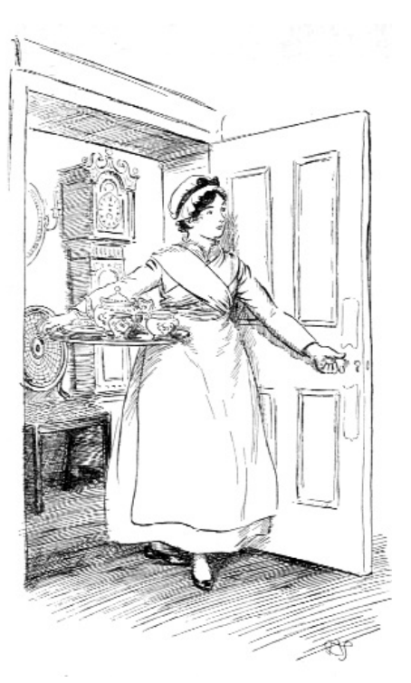
They are interrupted by the entrance of Patty with tea