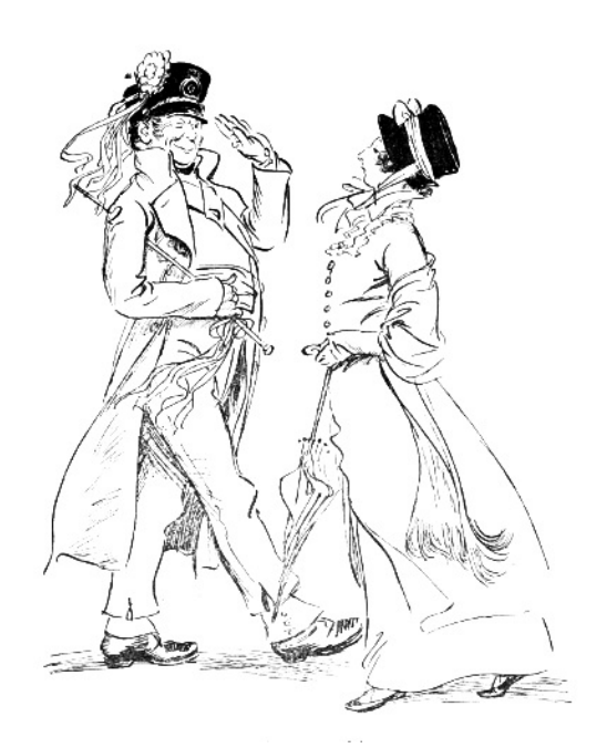
That impertinent recruiting sergeant Click to ENLARGE