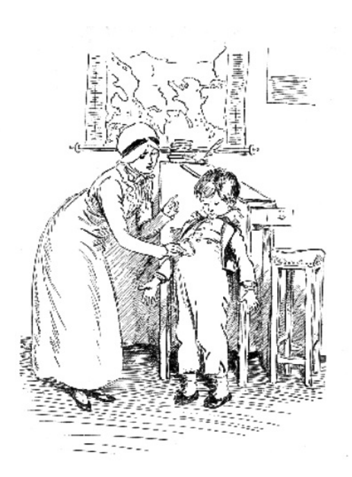
She writes a C on his chest with chalk