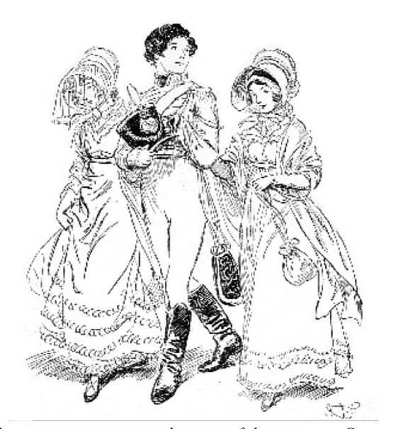
They are swept away on the arms of the impatient Captain

(At a venture) Excluding the unhappy Thomas.