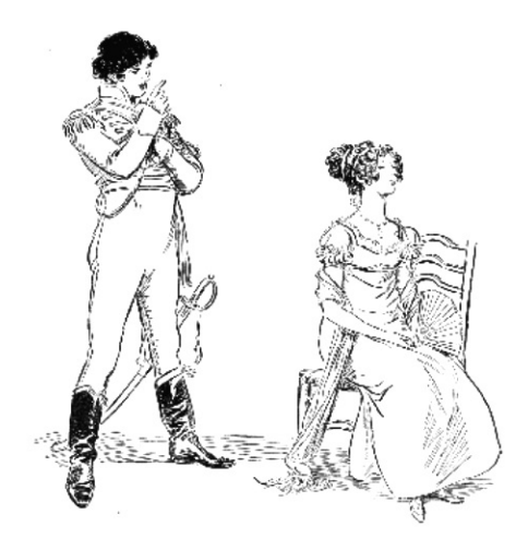
You are a shocking flirt