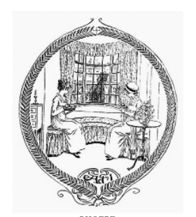
You know how gallantly he swings his cane

Ma'am, I must e'en tell them what they are wishful to hear. There ha' been five, ma'am, all this week, listening to me and then showing me their heels, but by a grand stroke of luck I have them at last.