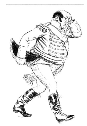
He has rushed away to destroy himself Click to ENLARGE

(MISS PHOEBE screws her nose at him merrily, and darts back to the dance, but she has left a defender behind her.)