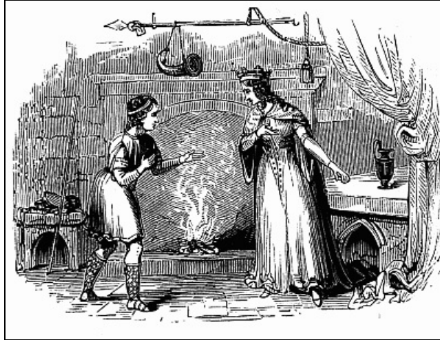
Bladud receiving a Ring from his Mother.

How sweet, how consoling, would have been the answer of a Christian parent to this agonizing question; but on Bladud's mother the heavenly light of Revelation had never shone. She knew not how to speak comfort to the breaking heart of her son, in those cheering words of Holy Writ, which would have been so applicable to his case in that hour of desertion: When thy father and thy mother forsake thee, I will take thee up. She could only weep with her son, and try to soothe his sorrow by whispering a hope, which she was far from feeling, that the day might come, when he could return to his father's court, cured of the malady which was the cause of his banishment.