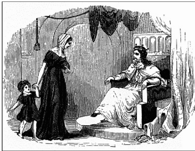
The widowed Mother begging protection.

"Who are ye?" said the king, when the mournful widow and her son, in obedience to his encouraging sign, advanced, and bowed the knee before him.