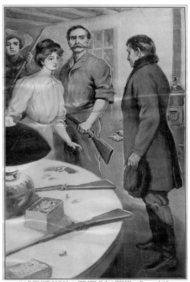
"AREN'T YOU A TRIFLE LATE?"—Page 160.

"You have done nothing for him?" he said.