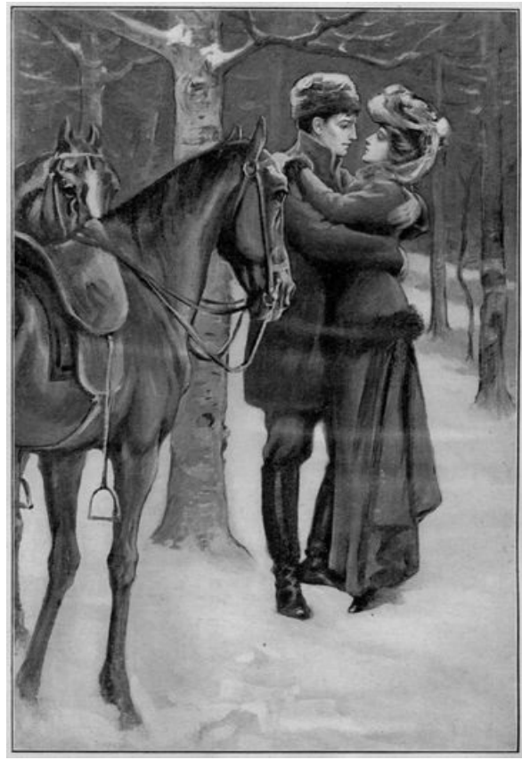
THERE WAS A NOTE IN HER VOICE THAT SET THE MAN'S HEART BEATING FURIOUSLY.—Page 267.

The girl drew back a pace. "I can't turn against my own people—but yours have turned on you. That makes it easier. If you will take me, dear, we will go away."