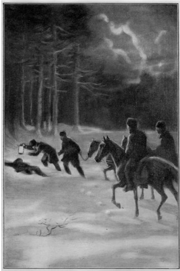
A WHITE FACE AND SHADOWY HEAD, FROM WHICH THE FUR CAP HAD FALLEN.— Page 114 .

"Well," said the big bushman, "we're going to get that man if we have to pull down Cedar Range or Clavering's place before we do it. Here's his trail. That one was made by Quilter's horse."