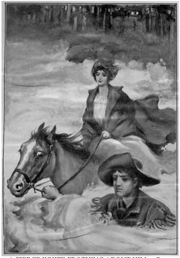
A FIERCE WHITE FROTHING ABOUT HIM.—Page