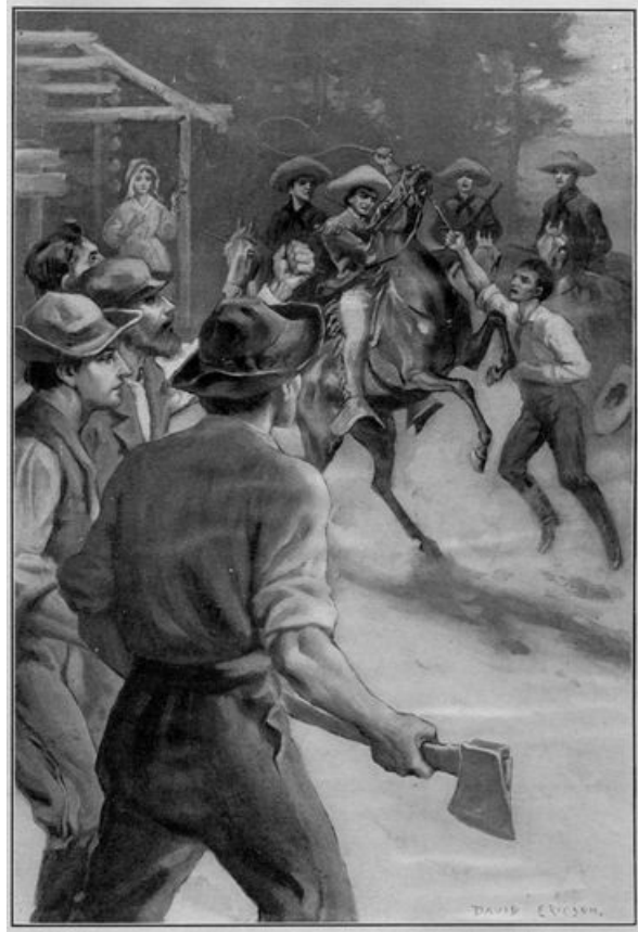
"COME DOWN!"—Page 47.

"Ja," said the Teuton. "I was in der Vosges, and der girl is also Fräulein Muller."