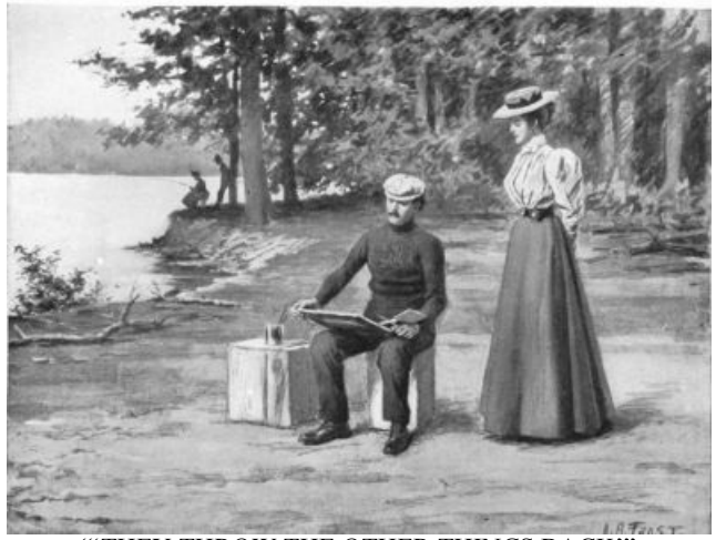
"THEY THROW THE OTHER THINGS BACK"

"It was very good of you to offer to teach me to fish with flies," she said, "and perhaps, if Uncle Archibald doesn't want to be bothered, I may get you to show me how to do it."