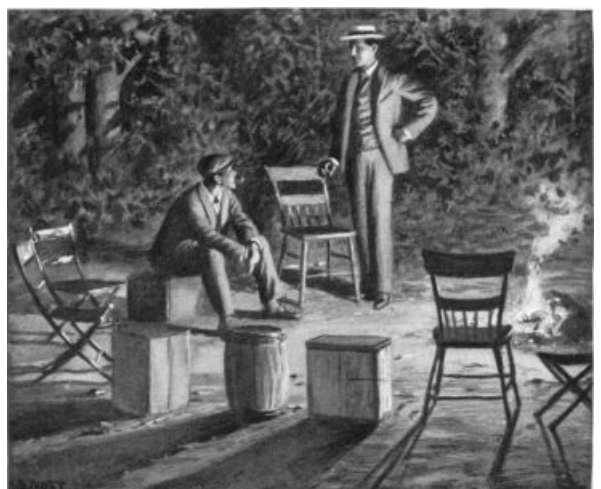
"WHERE ARE ALL OUR FRIENDS?"

"What is the matter?" asked the bishop. "Where are all our friends?"