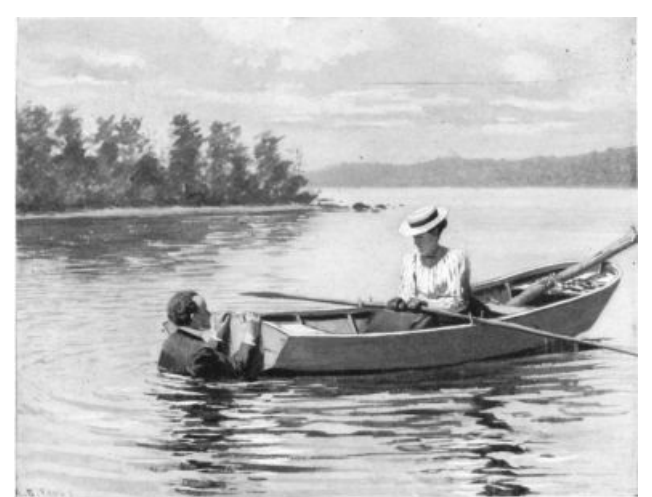
"BUT THE BISHOP KNEW BETTER"

will sit here I will take the oars and row you in."