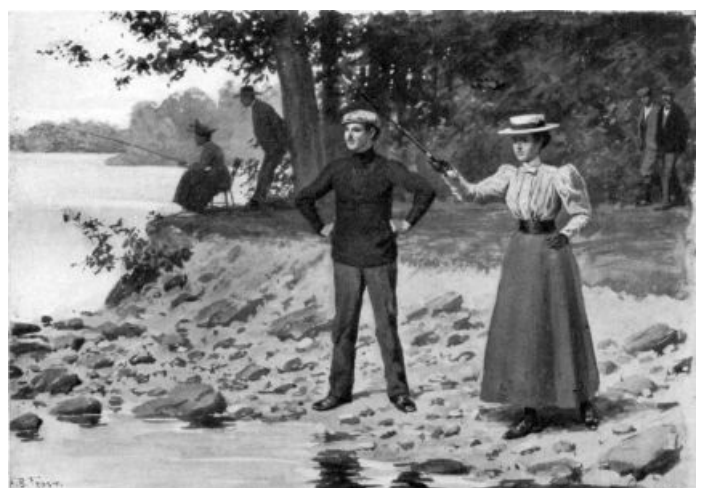
"A LESSON IN FLY-FISHING"

"I shall be obliged to surrender my post to you," he said, "which will be greatly to the lady's satisfaction, I imagine, for I must appear a poor attendant after you."