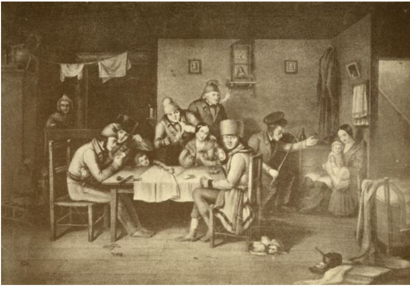
INTERIOR OF A FRENCH-CANADIAN FARM-HOUSE After a painting by Krieghoff

Within the habitant's abode there were usually not more than three regular rooms. The front door opened into a capacious living room with its great open fireplace and hearth. This served as dining-room as well. A gaily coloured woollen carpet or rug, made in the colony, usually decked the floor. There was a table and a couch; there were chairs made of pine with seats of woven underbark, all more or less comfortable. Often a huge sideboard rose from the floor to the low, open-beamed ceiling. Pictures of saints adorned the walls. A spinning-wheel stood in the corner, sharing place perhaps with a musket set on the floor stock downward, but primed for ready use. Adjoining this room was the kitchen with its fireplace for cooking, its array of pots and dishes, its cupboards, shelves, and other furnishings. All of these latter the habitant and his sons made for themselves. The economic isolation of the parish made its people versatile after their own crude fashion. The habitant was a handy man, getting pretty good results from the use of rough material and tools. Even at the present day his descendants retain much of this facility. At the opposite end of the house was a bedroom. Upstairs was the attic, so low that one could scarcely stand upright in any part of it, but running the full length and breadth of