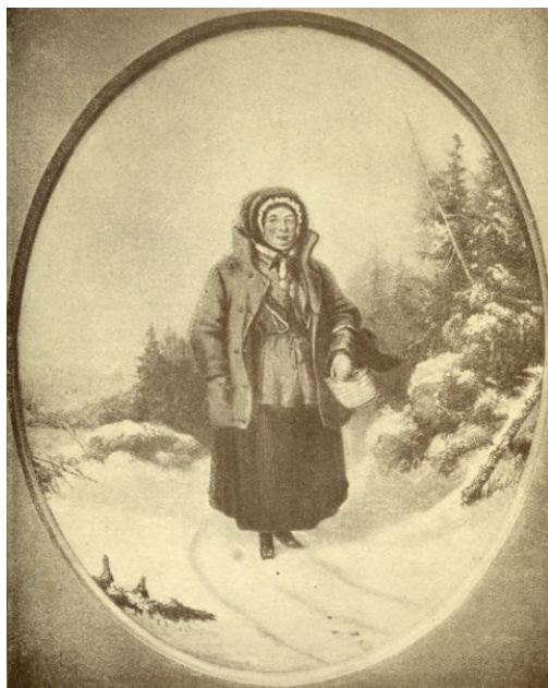
LA CANADIENNE After a painting by Krieghoff

to-do; the ordinary habitant could not afford it save on state occasions. Cheap beer, brewed in the colony, was within easier range of his purse. There were several breweries in the colony, although they do not appear to have been very profitable to their owners. Home-brewed ale was much in use. When duly aged it made a fine beverage, although insidious in its effects sometimes. But no guest ever came to any colonial home without a proffer of something to drink. Hospitality demanded it. The habitant, as a rule, was very fond of the flagon. Very often, as the records of the day lead us to believe, he drank not wisely but too well. Idleness had a hand in the development of this trait, for in the long winters the habitant had little to do but visit his neighbours.